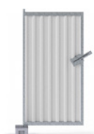
Smart pedestrian gate