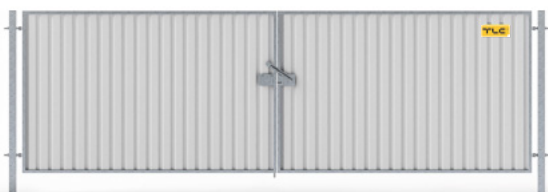
Smart vehicle gate