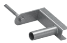
Pedestrian gate hinge