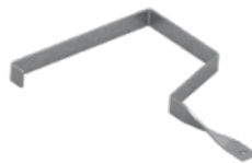
Anti lift device