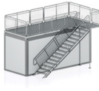
Terrace with stairs outside the container in a mirrored configuration