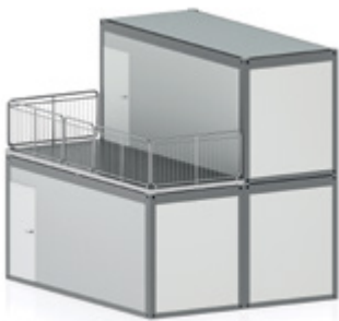
Terrace with stairs inside the container type I

The main purpose of container terraces is to extend the usable floor area according to individual needs of a client. Terraces can be assembled on any standard container. Choosing the right railing as well as terrace floor is usually imposed by the law. For both railing and terrace fulfillment TLC offers a standard solution or bespoke project. The entry to the terrace is possible thanks to the standard container stairs which can be assembled both inside and outside the container.