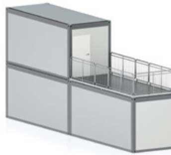
Terrace with stairs inside the container type II