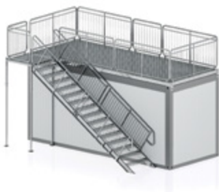
Terrace with stairs outside the container