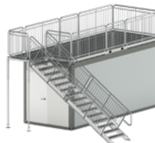
Terrace with stairs on short side of the container