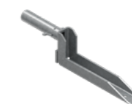
Drop-in holder EPS-UWB 3 kg