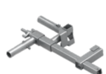
Stair holder EPS-UUN-V4 7 kg