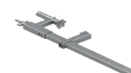
Clamping holder L800 EPS-UUN800-V2 8,5 kg