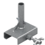
Girder holder EPS-UDZ-V2 3,4 kg