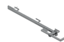
Bracket clamp with post EPS-UUS 7,2 kg