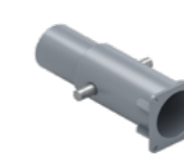
Vertical permanent holder EPS-UZV-V2 0,2 kg