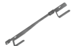
Double wall holder EPS-US2 1,7 kg