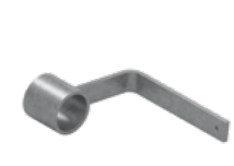
Plank lower holder EPS-UDS 0,3 kg