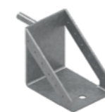
Working platform holder EPS-UPR 1,8 kg