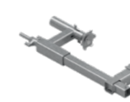
Clamping holder EPS-UUN-V2 5,5 kg