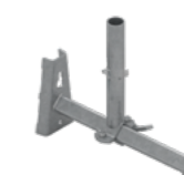
Facade holder EPS-USP 3,9 kg